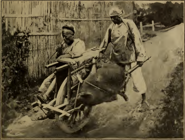
GOING TO MARKET.